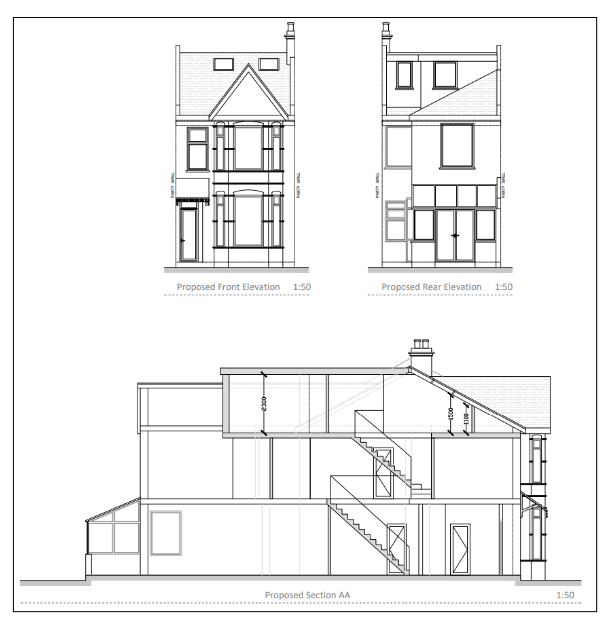
Figures 2 and 3 - Proposed Elevations and Plans