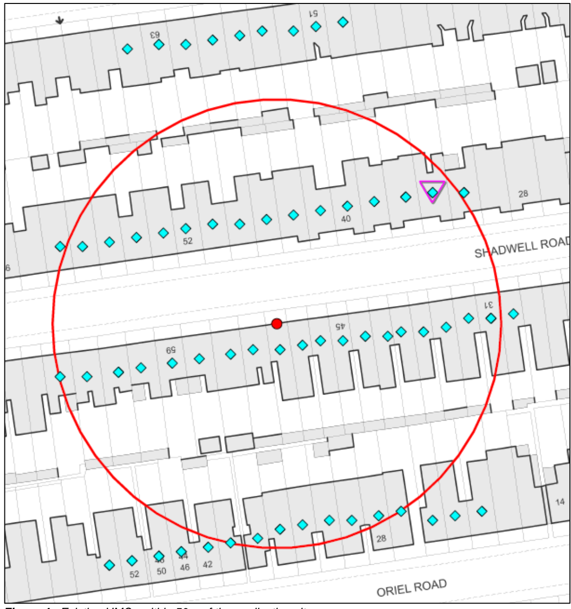
Figure 4 - Existing HMOs within 50m of the application site